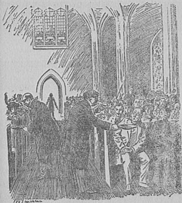
A MORE HONORABLE WAY

Again the money-changers are operating in the house of the Lord, and again seem appropriate the words of the Master: "It is written, My