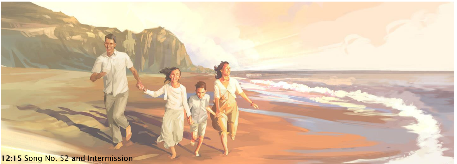
12:15 Song No. 52 and Intermission