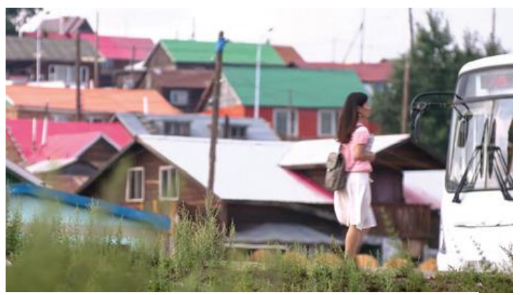
• What challenges did the three sisters overcome to become pioneers?

WATCH THE VIDEO THREE SISTERS IN MONGOLIA, AND THEN ANSWER THE FOLLOWING QUESTIONS: